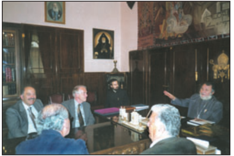
His Holiness Karekin II, with Fresno State delegation.

After lunch, His Holiness Karekin II, received the Fresno