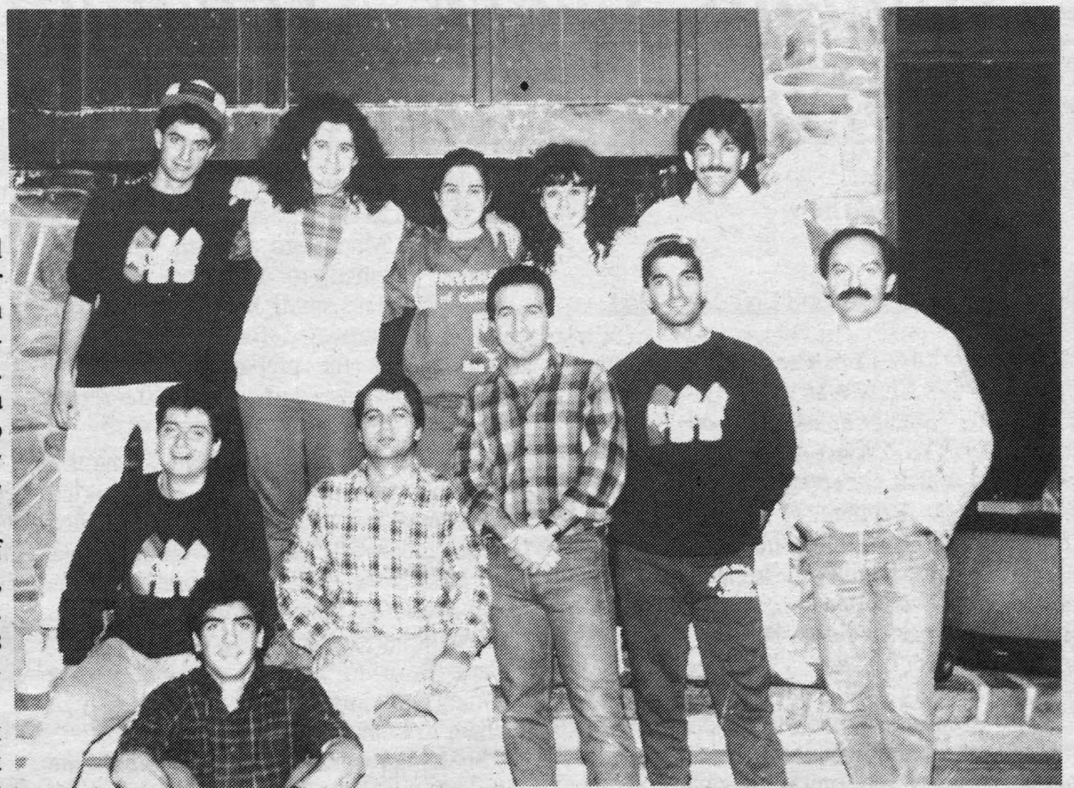
Students from the first statewide Armenian Student Organization retreat spent two nights and three days in the Sierra Nevada mountains. The retreat was an opportunity for young Armenians to get together and discuss the important issues of the day, as well as to enjoy each others company.

The Fresno ASO would like to thank all those who participated in the retreat. It was such a success for all involved and it is hoped to start a tradition.